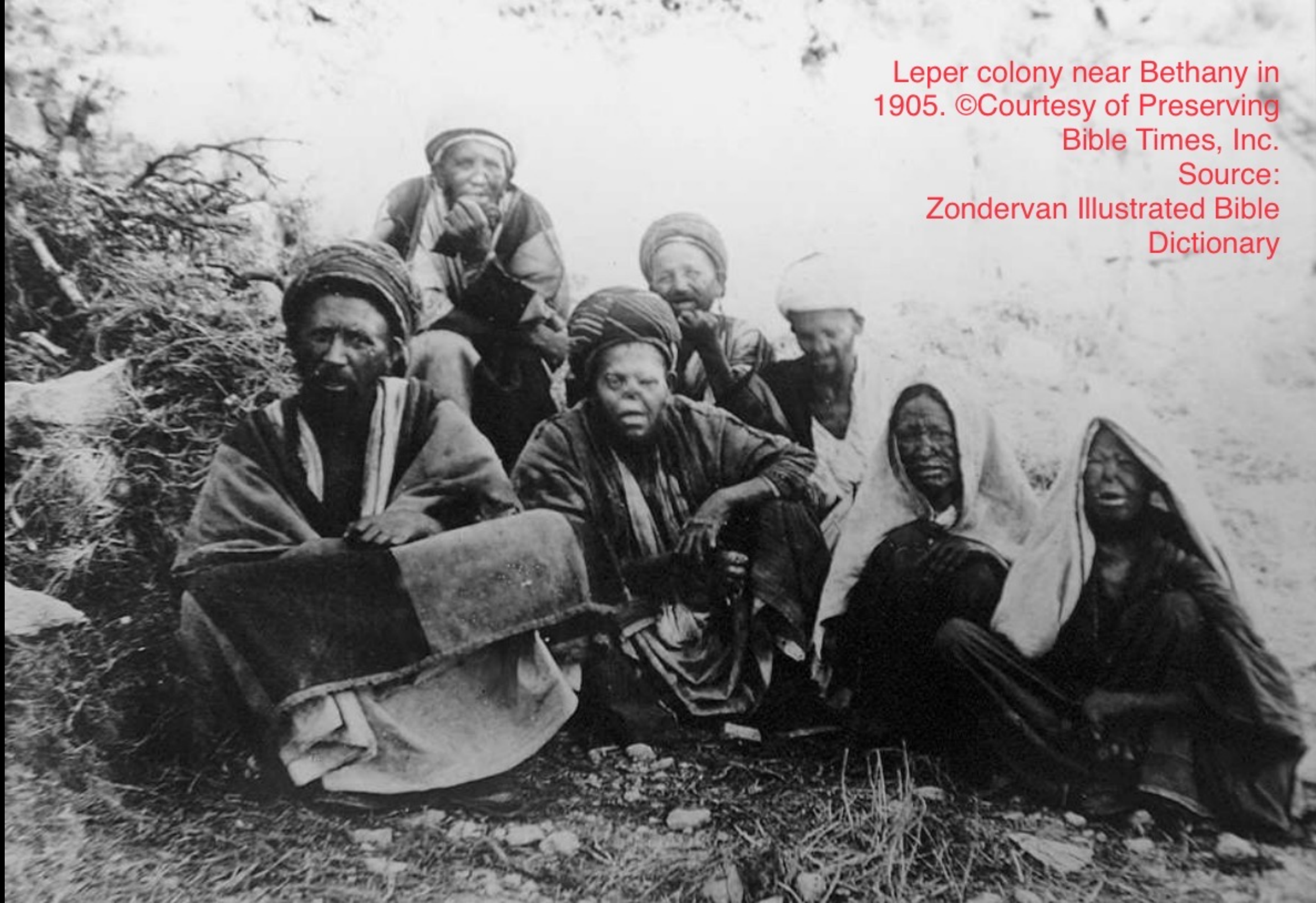
Leper colony near Bethany in 1905.